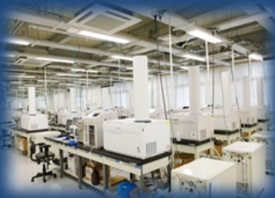
Metabolomics Factory in Keio Univ.

HMT provides metabolomics services and metabolite biomarkers (mBm) of diseases.